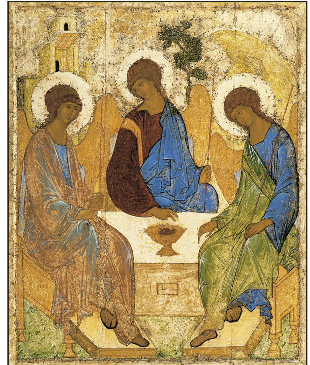
Holy Trinity, Andrei Rublev (1425-1427)

Master of Arts in Church Ministries, with a focus in Spirituality