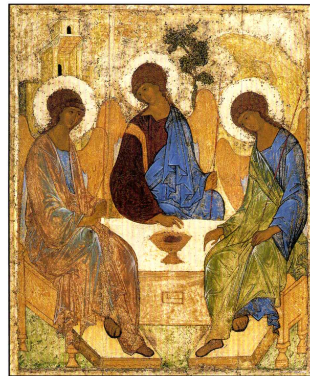
Holy Trinity, Andrei Rublev (1425-1427)

Master of Arts in Church Ministries, with a focus in Spirituality